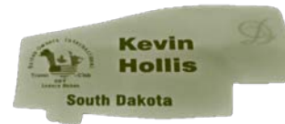
New Style Name Badges