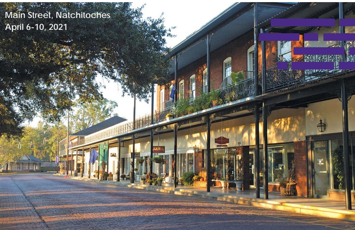
Main Street, Natchitoches April 6-10, 2021