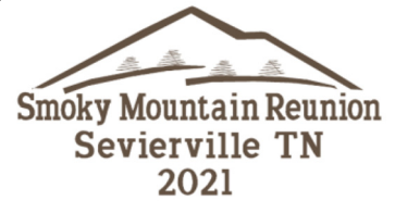
Sleeve of shirt